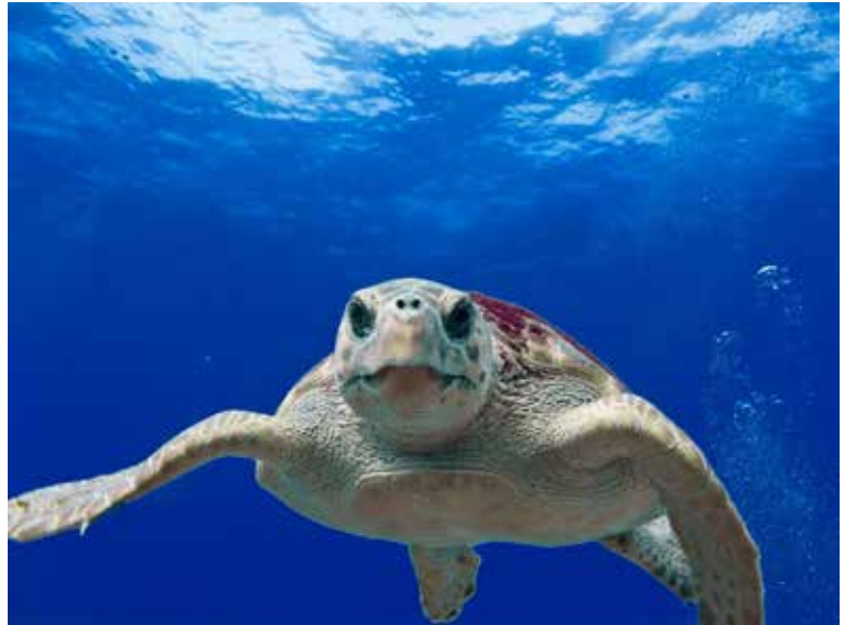
Loggerhead Sea Turtle